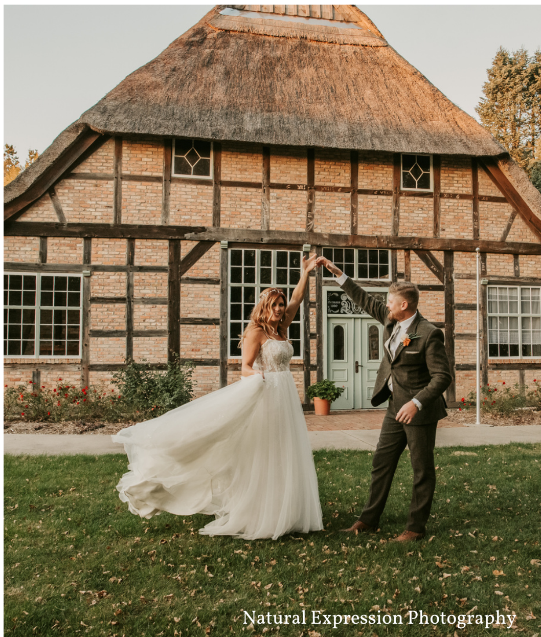
Natural Expression Photography