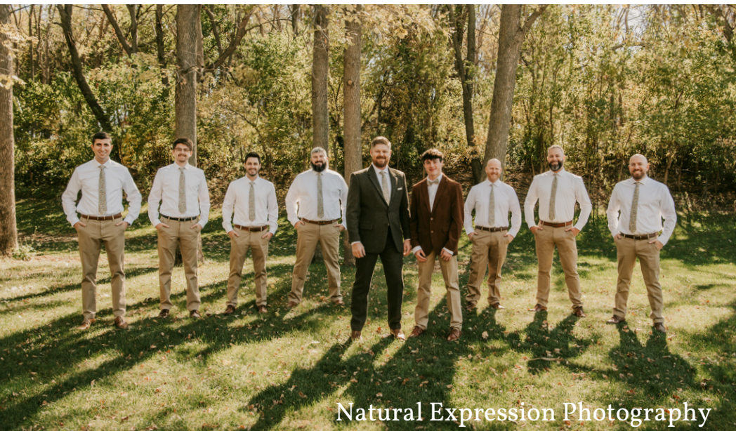
Natural Expression Photography